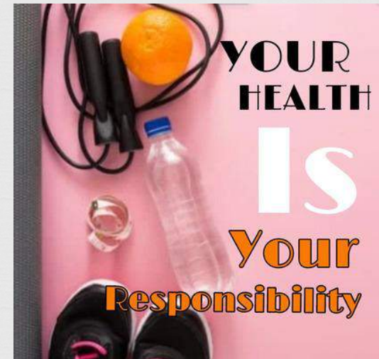
Pic. 2- Logo of the project: “ Your Health is your Responsibility”