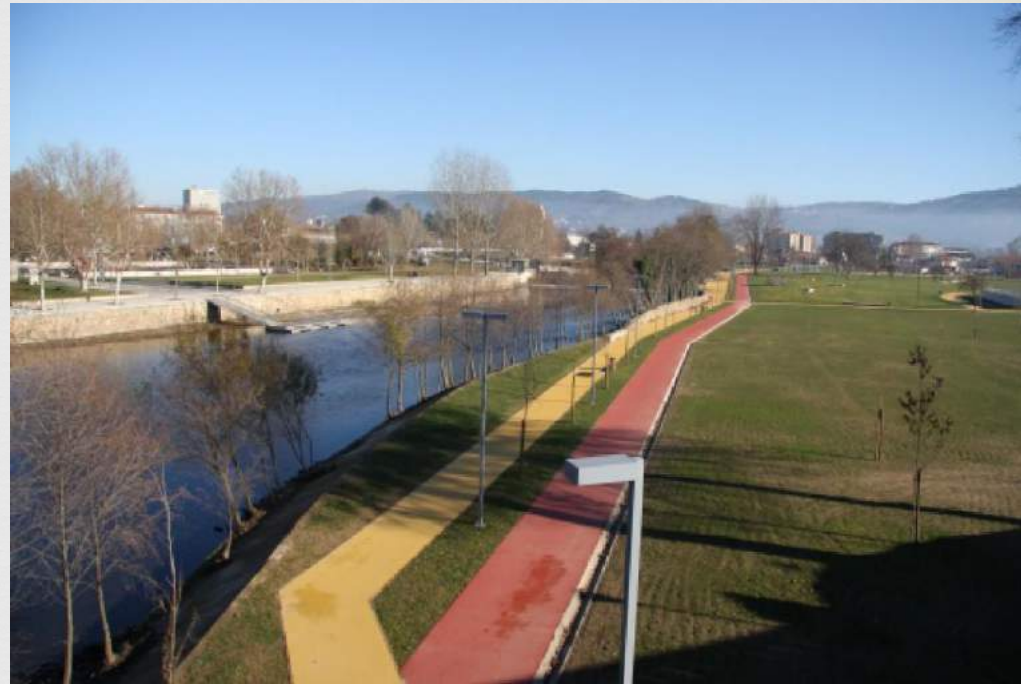
Pic.3- A section of Chaves cycle path