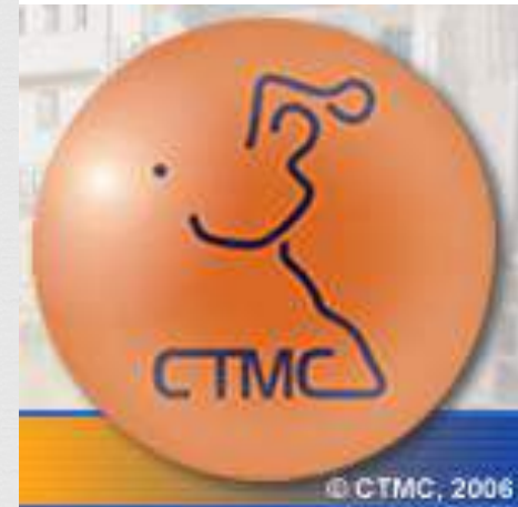
Pic.5- BTT; Pic.6- CTMC