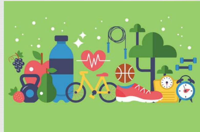
Pic.7- Healthy Habits in general.